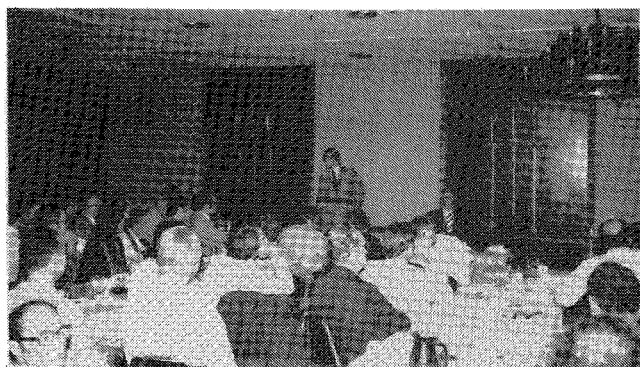
Link addresses meeting.